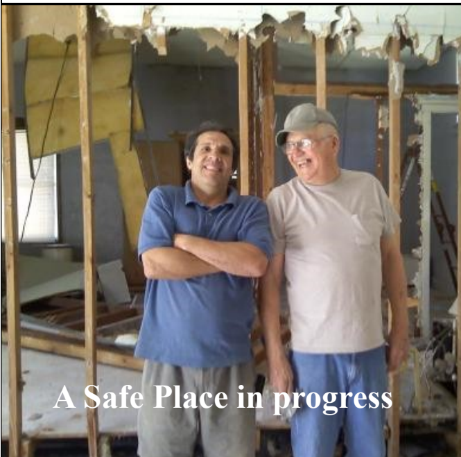
A Safe Place in progress

Little Lambs Inc. is a 501[c][3] Not for Profit Organization