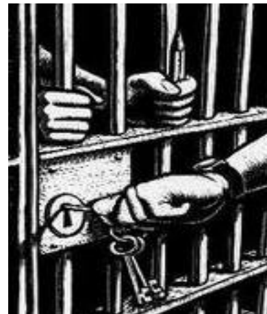
God's Word is the key .

Codependency: can be just as strong a prison as drugs and alcohol and just as dangerous.