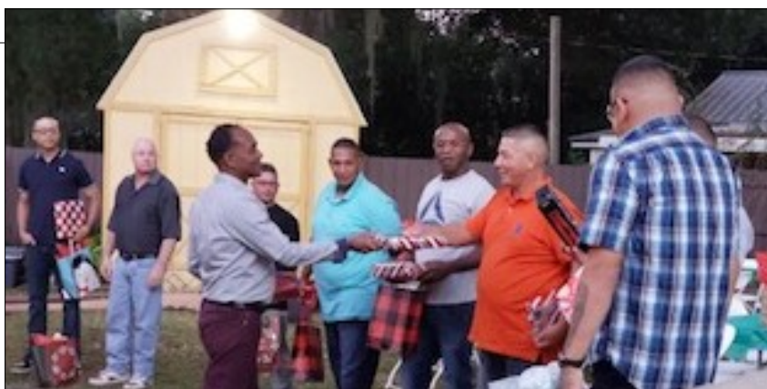
Christmas Eve at Second Chance Ministry

Schedule January 2022 Tues....Biblical Marriage Family & Parenting @ Avon Park Prison Tues....Purpose Driven Life @ 2nd Chance Ministry Wed....Biblical Boundaries Marriage & Family with 2nd Chance Ministry Thurs....Celebrate Recovery @ 2nd Chance Ministry Counseling by Appointment 863-273-6075